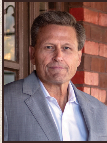
Author: David Baldacci

I started writing this novel well over a decade ago, by hand, in a journal like the one my mother gave me as a child to jot down my stories. Then I set the manuscript aside to work on other projects, but something kept pulling me back to the story, and it has to do with my past.